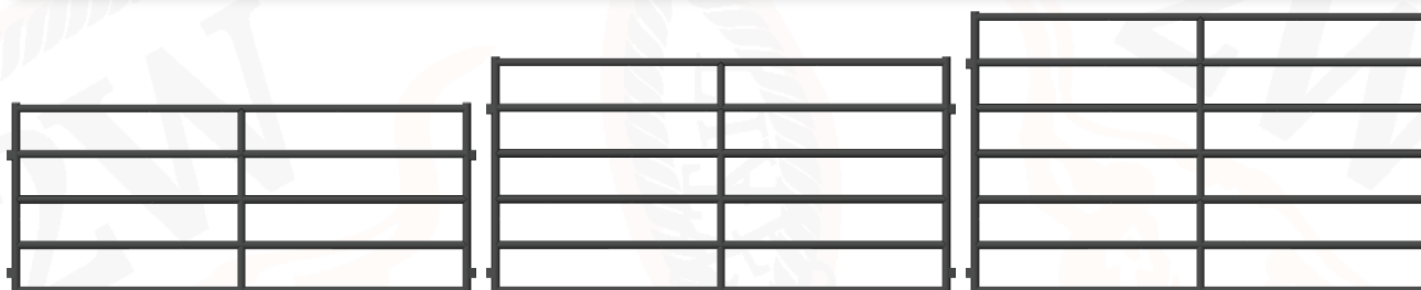
"400" Series 10'Panel